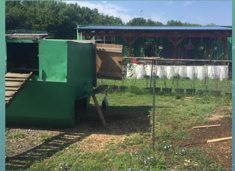
Turning an old trash dumpster into a chicken coop