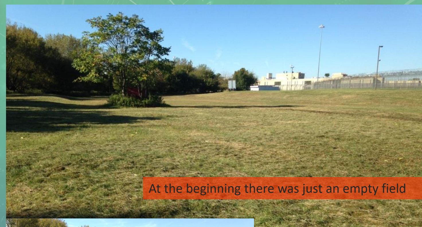
At the beginning there was just an empty field