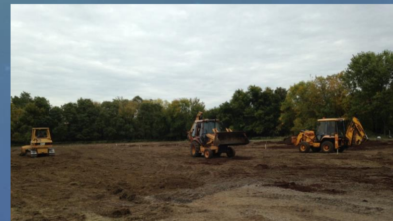
A 16 inch deep gravel layer with landscape cloth underneath had to be removed with the Bulldozer so that fruit trees can grow in actual soil