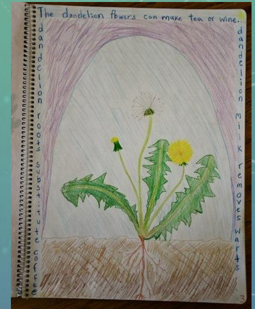
Students make their own lesson books