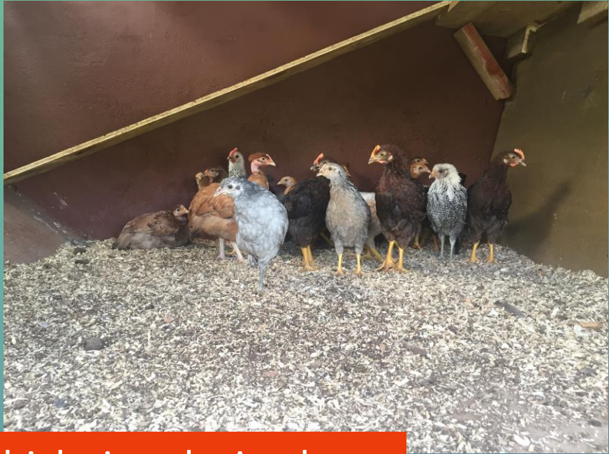
Raising baby chicks into laying hens