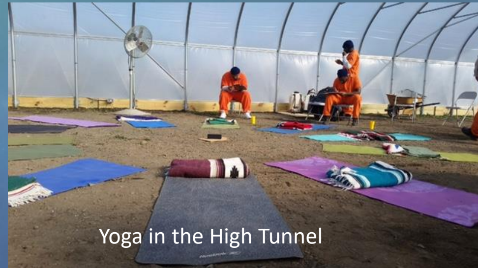
Yoga in the High Tunnel