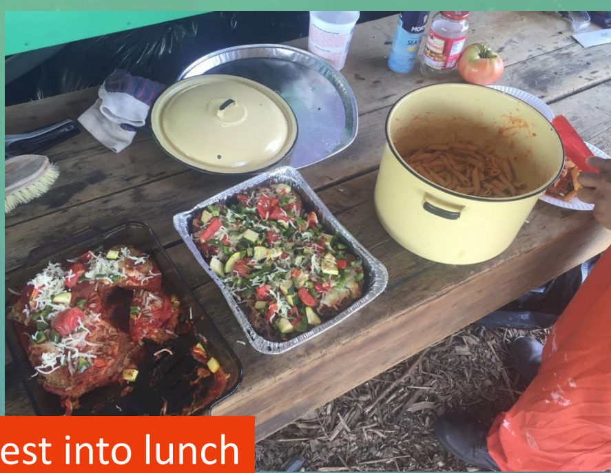
Turning the harvest into lunch