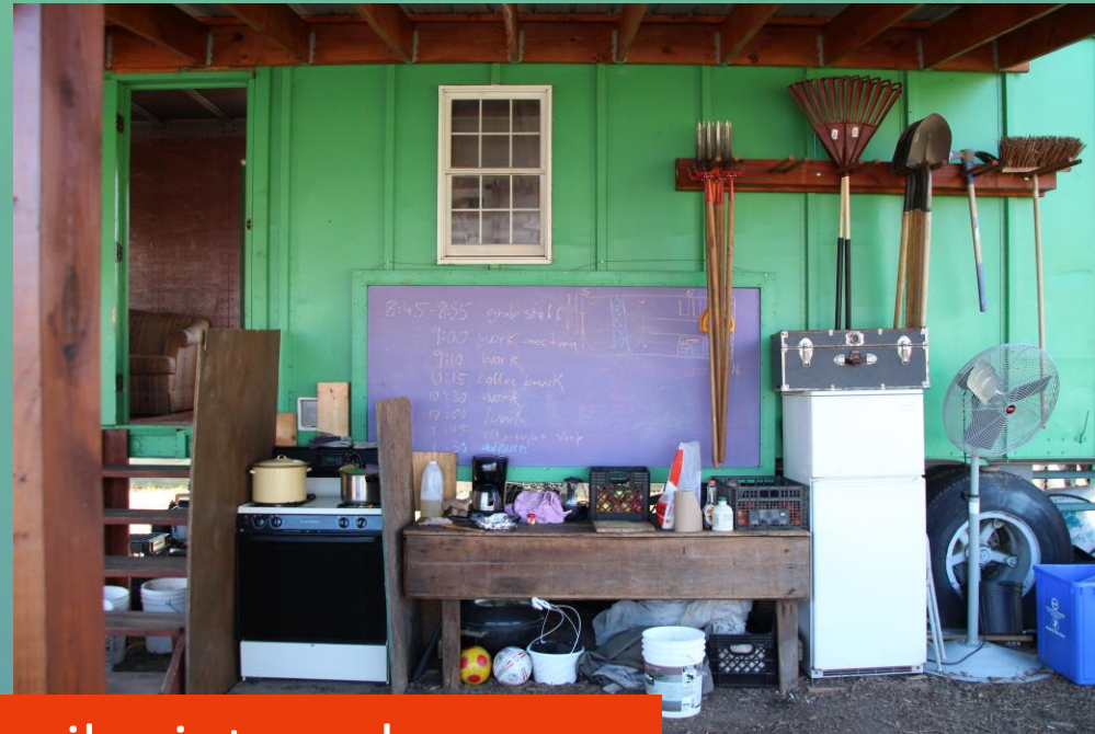
Turning an old trailer into a classroom