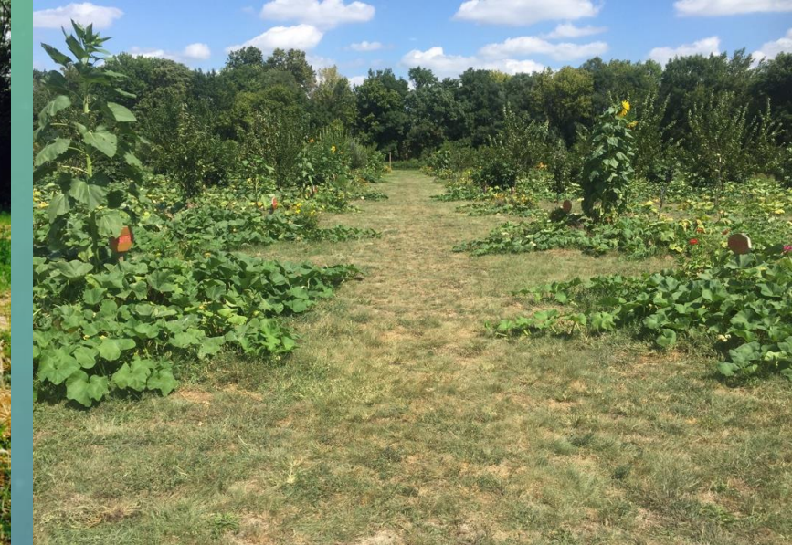
Over 250 fruit trees along with watermelon, strawberries and veggie grwon on a three acre former storage yard